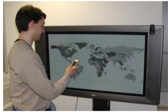
Figure 2. The World Map Application

Tens of millions of Bluetooth-enabled camera-phones have already been shipped globally, with market trends showing that the rapid adoption of such devices is set to continue for the foreseeable future. Our work demon-