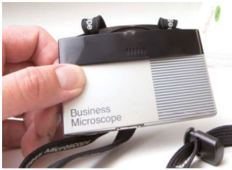
Figure 1: The Hitachi Business Microscope (HBM) [1]